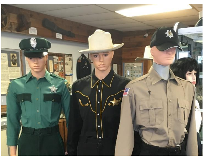
Reserve Deputy 1969, Posse 1956