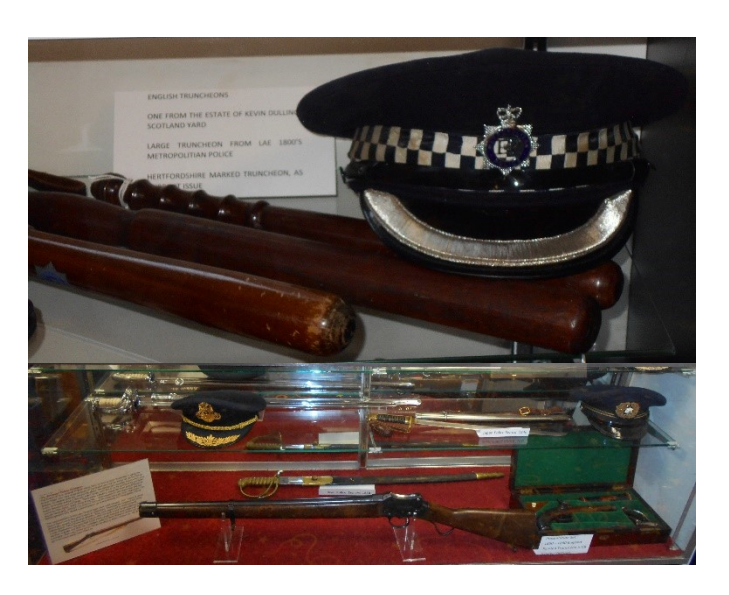
INTERNATIONAL POLICE MUSEUM, 212 N. HWY 101, ROCKAWAY BEACH, OR